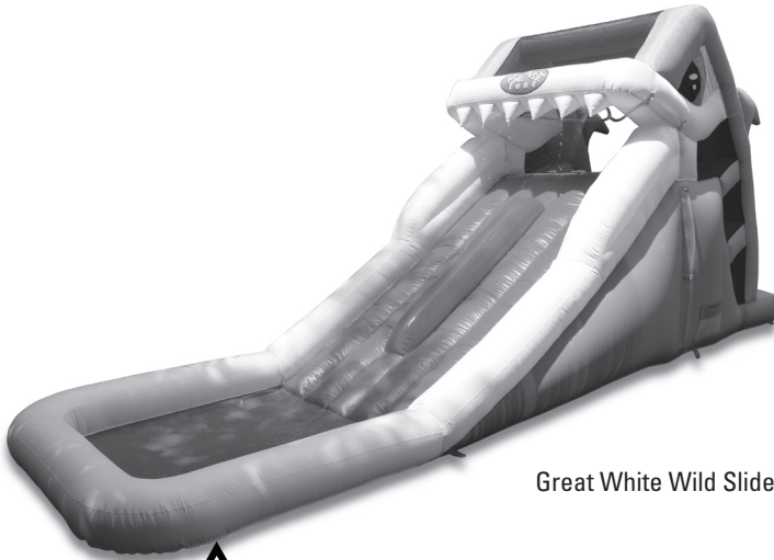
Great White Wild Slide™ by Blast Zone®

Vortex International Enterprises or any of its subsidiaries may not be held liable for any breach of contract, fiduciary duty, negligence, negligent design, negligent manufacturing, failure to warn for defects in design, materials or workmanship, under any statute, consumer protection legislation, or any regulations passed there under, or for absolutely any other potential cause of action or absolutely any other basis upon which liability may otherwise be found, is strictly limited, without exception, to repair or replacement of the product, at our sole discretion. In no way shall Vortex be responsible for incidental, consequential, resultant or contingent damages of absolutely any type, whatsoever, whether these damages were cause or incurred by our breach of contract or negligence or by any other cause whatsoever. If any part of this warranty, exclusion, disclaimer and limitation of liability clause is determined to be invalid or unenforceable in whole or in part, such invalidity or unenforceable provision will attach only to such provision or part thereof and the remaining part of such provision and all other provision will continue in full force and effect. Vortex reserves the right to change or modify this product within reason without notice, and without obligation to modify existing products.