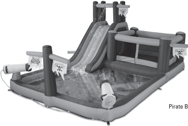
Pirate Bay™ by Blast Zone®

Vortex International Enterprises or any of its subsidiaries may not be held liable for any breach of contract, fiduciary duty, negligence, negligent design, negligent manufacturing, failure to warn for defects in design, materials or workmanship, under any statute, consumer protection legislation, or any regulations passed there under, or for absolutely any other potential cause of action or absolutely any other basis upon which liability may otherwise be found. Liability is strictly limited, without exception, to repair or replacement of the product, at our sole discretion. In no way shall Vortex be responsible for incidental, consequential, resultant or contingent damages of absolutely any type, whatsoever, whether these damages were caused or incurred by our breach of contract or negligence or by any other cause whatsoever. If any part of this warranty, exclusion, disclaimer and limitation of liability clause is determined to be invalid or unenforceable in whole or in part, such invalidity or unenforceable provision will attach only to such provision or part thereof and the remaining part of such provision and all other provision will continue in full force and effect. Vortex reserves the right to change or modify this product within reason without notice, and without obligation to modify existing products.