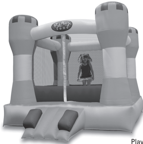
Play Palace™ by Blast Zone®

Vortex International Enterprises or any of its subsidiaries may not be held liable for any breach of contract, fiduciary duty, negligence, negligent design, negligent manufacturing, failure to warn for defects in design, materials or workmanship, under any statute, consumer protection legislation, or any regulations passed there under, or for absolutely any other potential cause of action or absolutely any other basis upon which liability may otherwise be found, is strictly limited, without exception, to repair or replacement of the product, at our sole discretion. In no way shall Vortex be responsible for incidental, consequential, resultant or contingent damages of absolutely any type, whatsoever, whether these damages were caused or incurred by our breach of contract or negligence or by any other cause whatsoever. If any part of this warranty, exclusion, disclaimer and limitation of liability clause is determined to be invalid or unenforceable in whole or in part, such invalidity or unenforceable provision will attach only to such provision or part thereof and the remaining part of such provision and all other provision will continue in full force and effect. Vortex reserves the right to change or modify this product within reason without notice, and without obligation to modify existing products.